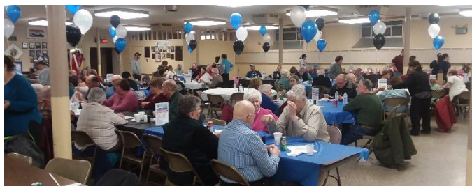
The patrons supporting the fundraiser and enjoying a great meal.