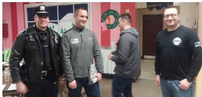
Some of the fine Officers in attendance

Thanks to all of you for another successful COPS Walk fundraiser. For those of you still unfamiliar with the COPS Walk, this is a program whereby police officers raise funds to support the families of Officers who fall in the line of duty. Each year members of the WPD make the journey to Washington, D.C. (most of them actually run it) in support of this program. Our efforts help them to achieve their goal. Through your hard work and the generosity of the Woonsocket Community, we are able to donate $2500 to this very worthy cause.