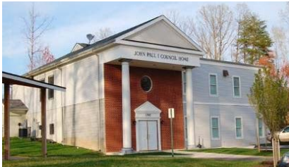
John Paul I Center Council Meetings: 1st and 3rd Wednesdays

JP1 CENTER HOURS Friday 7pm - 11pm See calendar for special Events Phone 703-590-5962