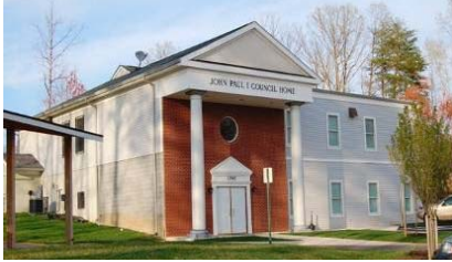
John Paul I Center Council Meetings: 1st and 3rd Wednesdays

JP1 CENTER HOURS Friday 7pm - 11pm See calendar for special Events Phone 703-590-5962